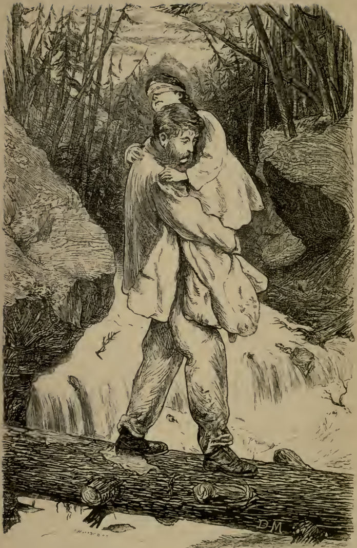
Over the Forester's Bridge.